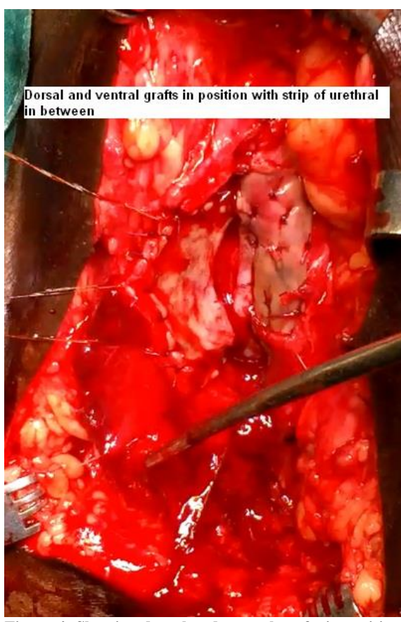
Figure 4: Showing dorsal and ventral grafts in position with strip of urethral plate in between