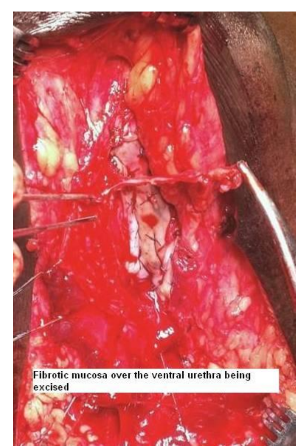
Figure 3: Showing fibrotic mucosa over ventral urethra being excised.