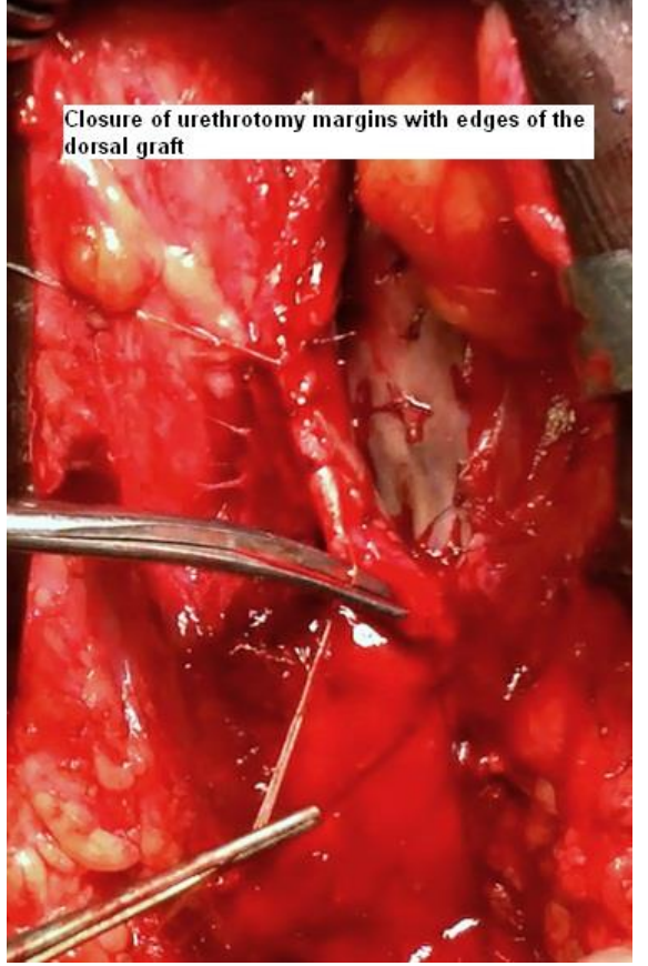
Figure 5: Showing closure of urethrotomy margins with edges of the dorsal graft